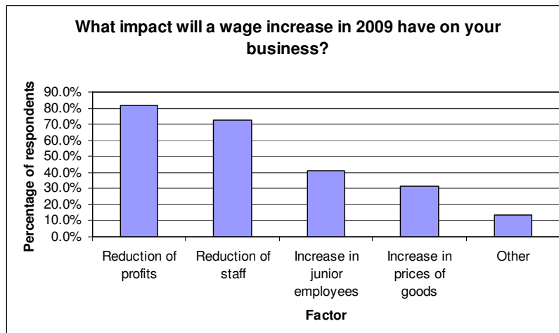
Figure 1. What impact will a wage increase in 2009 have on your business?